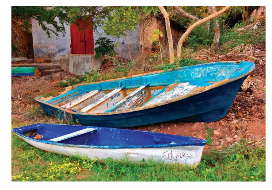
\textit{Blue Boats}, South \ American \ Portfolio. \